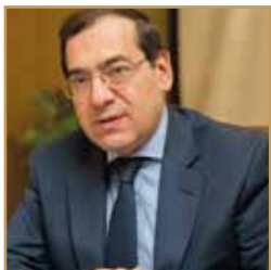
His Excellency, Tarek El Molla Minister of Petroleum and Mineral Resources Arab Republic of Egypt