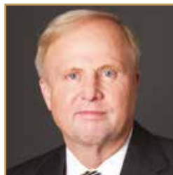
Bob Dudley Group Chief Executive BP